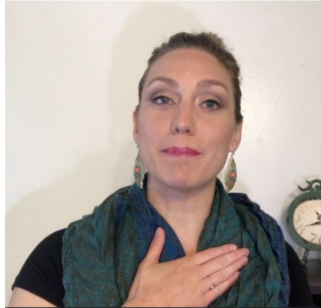
My Turn (Pat chest)