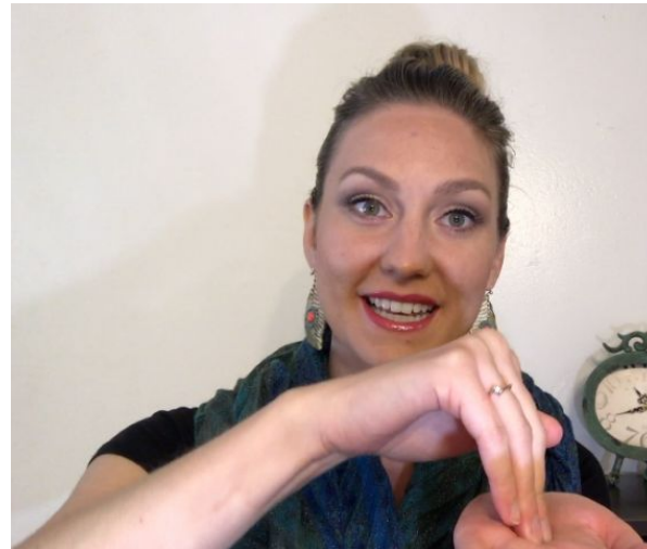
Again (Dive one hand into the other)