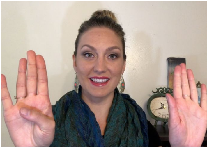
OPEN (Open closed hands)