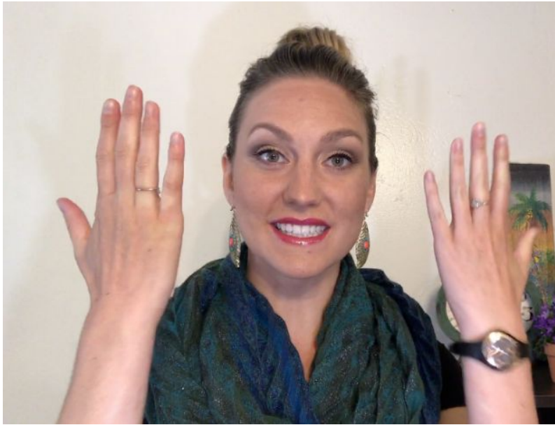
All Done (Twist hands)